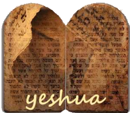
the Living Torah

and it was written in Hebrew, and Greek, and Latin.